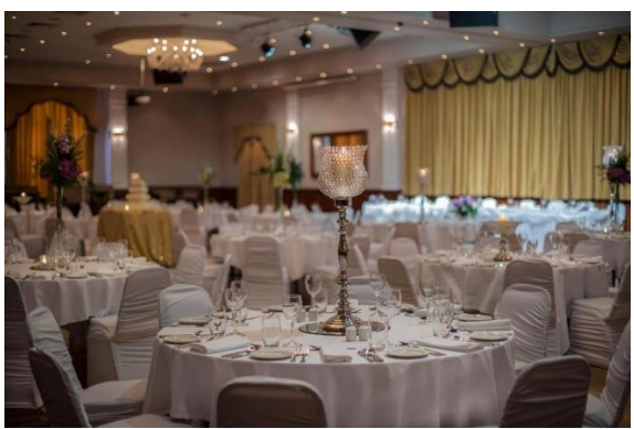
The Glencarn Hotel, Monaghan Road, Castleblayney, A75 AP92